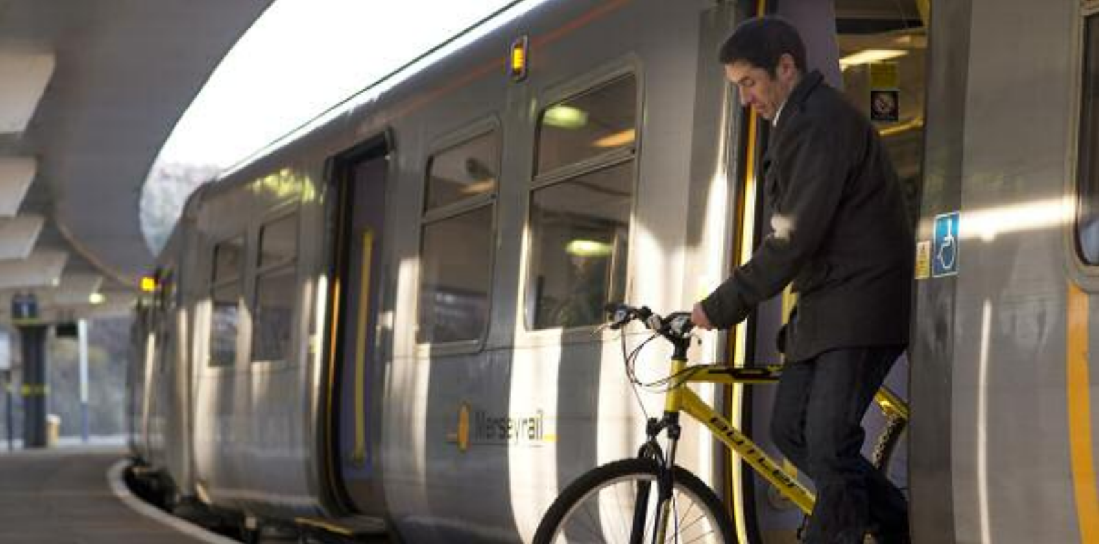
Merseyrail Wirral Line