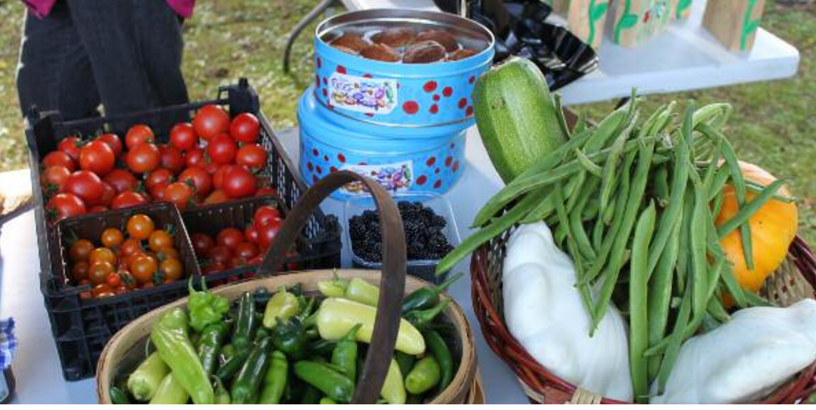
Local and seasonal food. Transition Town West Kirby.