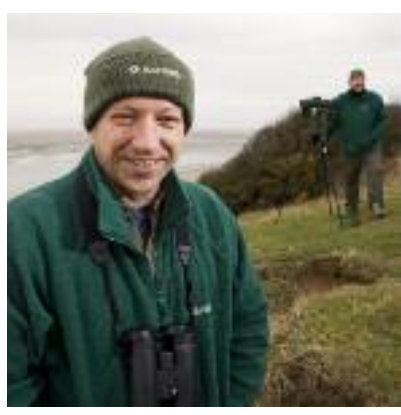
Get involved in practical conservation