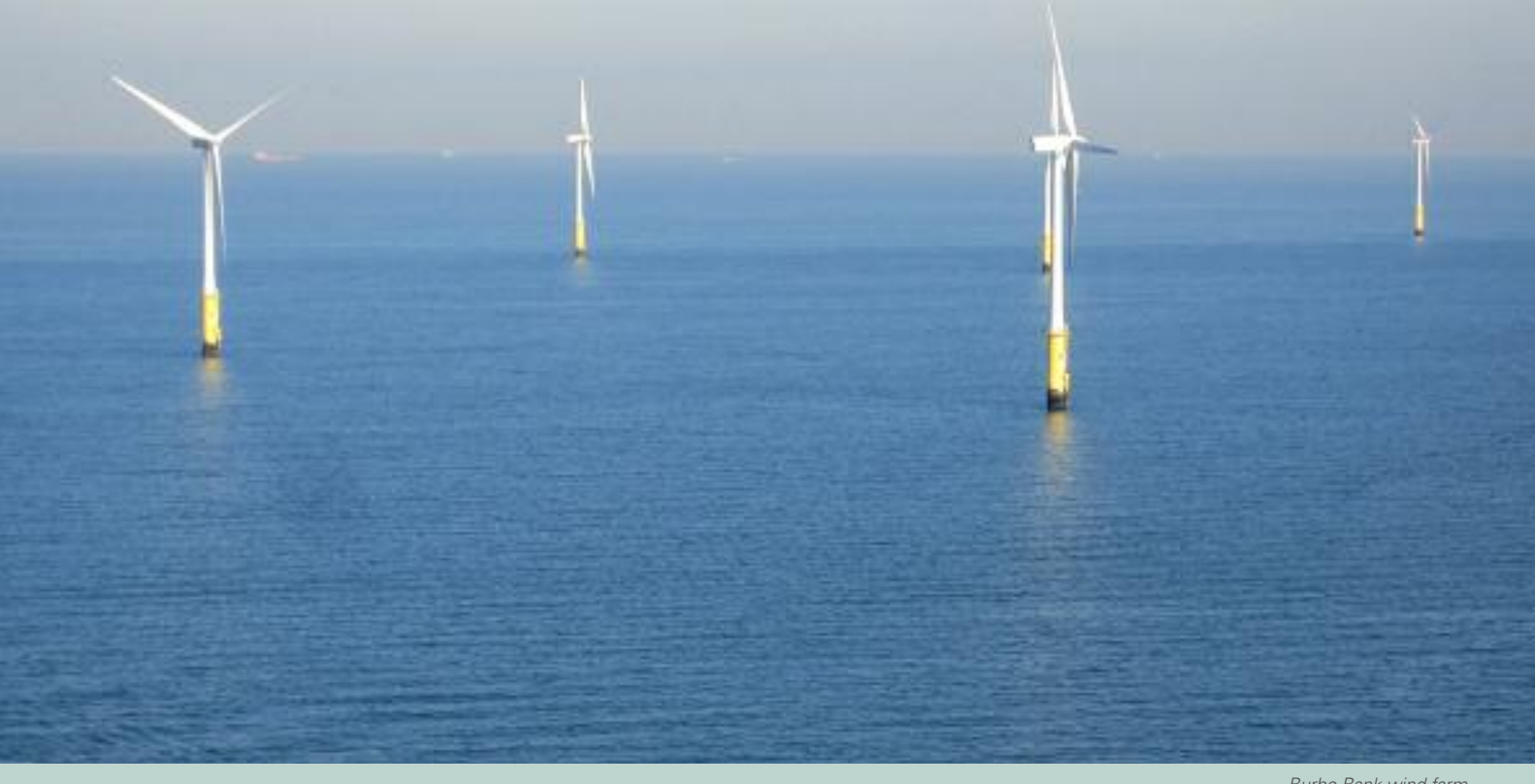
Burbo Bank wind farm