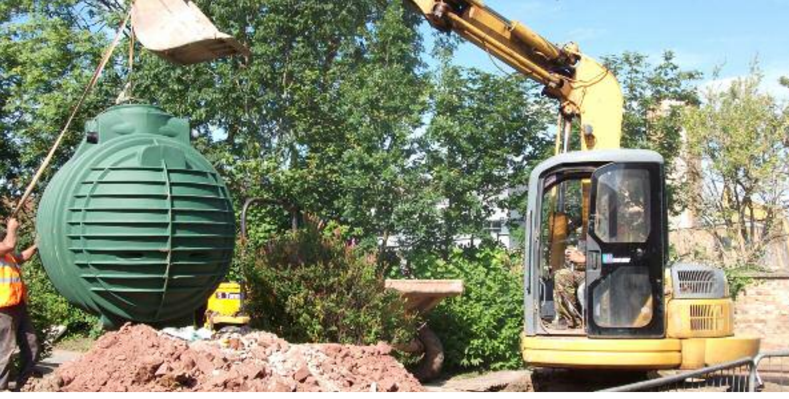
Rainwater harvesting. Raincatcher products and services Ltd, Wallasey.