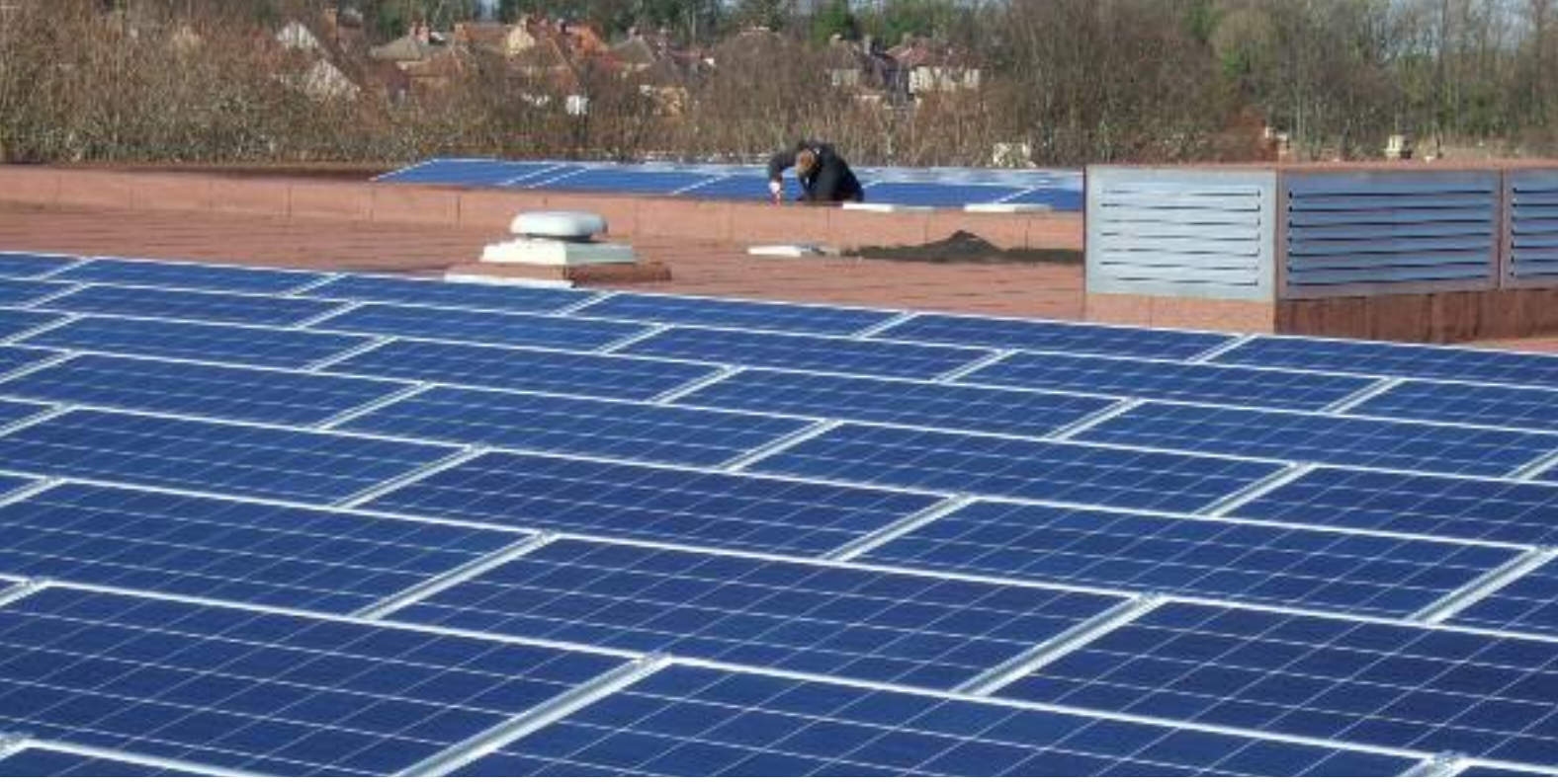
Solar PV installation, Oval Sports Centre