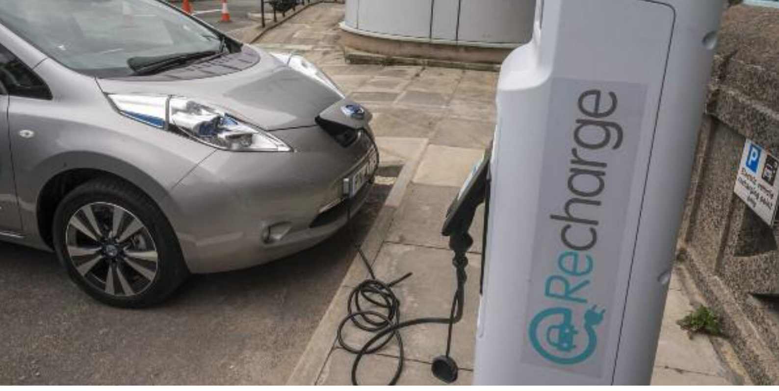
Vehicle Recharge point, Seacombe Ferry