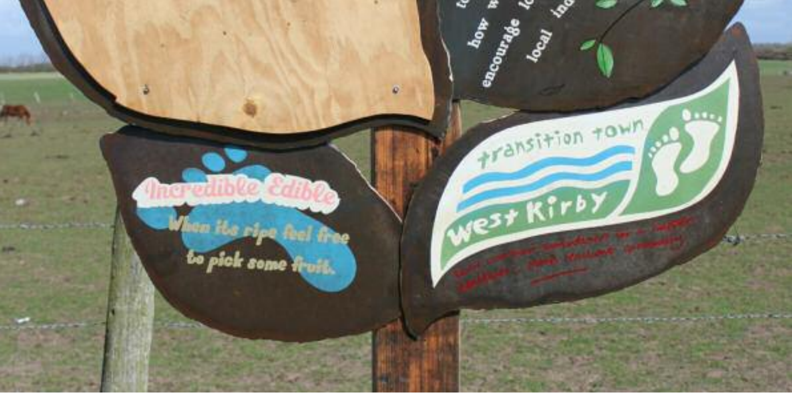
Apple Avenue. Transition Town West Kirby.