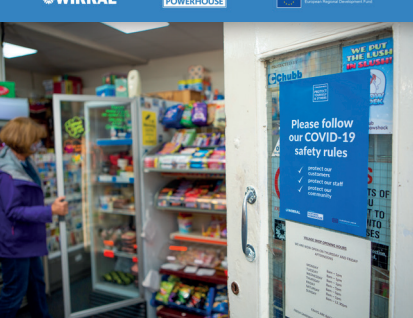
Top: Active Wirral campaign Bottom: COVID-secure campaign aimed at businesses