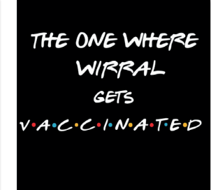
The Winter Vax campaign included Social media graphics targeting 20-29 year olds