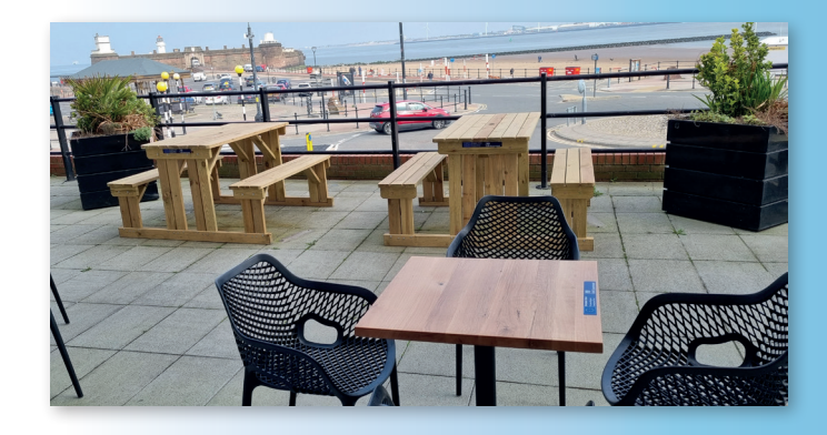
Top: All Wirral businesses were sent details about how to make their business ready for winter Bottom: Floral Pavilion received funding to improve outdoor seating